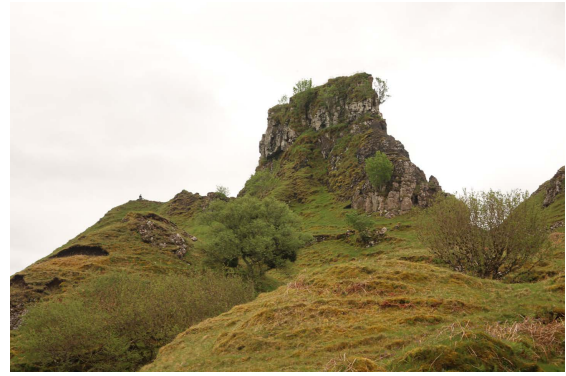
Figure North Skye 13.8: Fairy Glen.