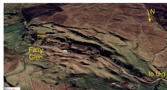
Figure North Skye 13.3: Annotated oblique Google Earth® image for the Fairy Glen area.

The Fairy Glen area comprises meandering paths around the spires, mounds and pools that are the result of landslips that have developed (most likely in the Holocene Epoch), whereby fragments of the Paleocene lava field have moved over the underlying mechanically weak Upper Jurassic strata of the Staffin Shale Formation.