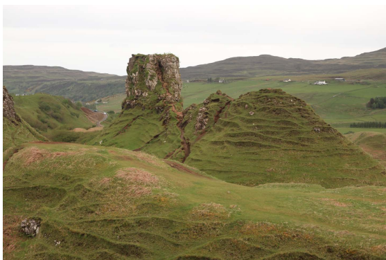
Figure North Skye 13.6: Fairy Glen.