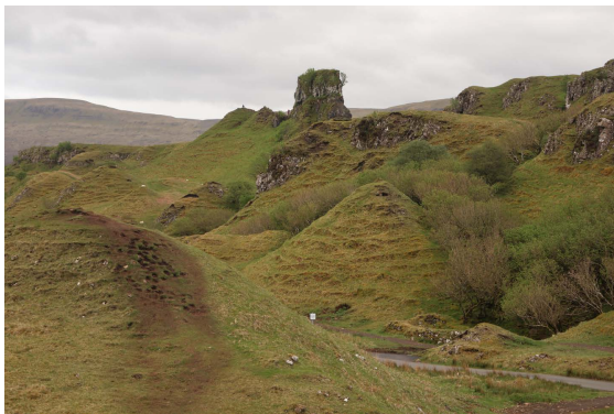
Figure North Skye 13.5: Fairy Glen.