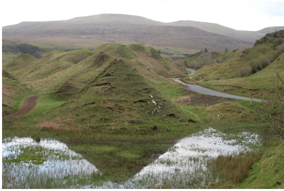
Figure North Skye 13.4: Fairy Glen.