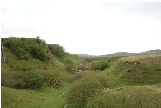
Figure North Skye 13.7: Fairy Glen.