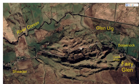
Figure North Skye 13.2: Annotated Google Earth® images for the Fairy Glen area.