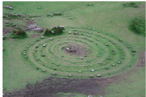
Figure North Skye 13.9: A stone circle attributed by some weak-minded people to the fairies. In reality, a crude attempt to mimic the handywork of the fairies, whose labours are only seen by believers when everyone has gone home.